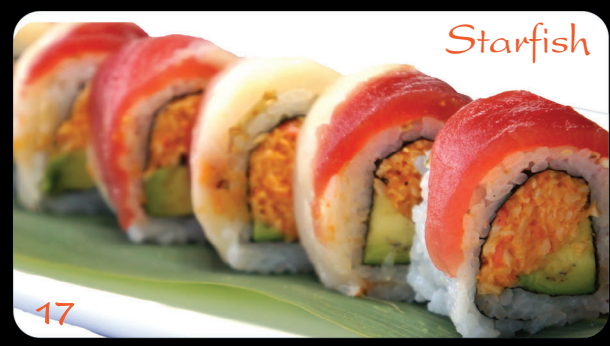
Spicy crab, avocado, tuna, yellow tail w/ tobiko and sesame dressing