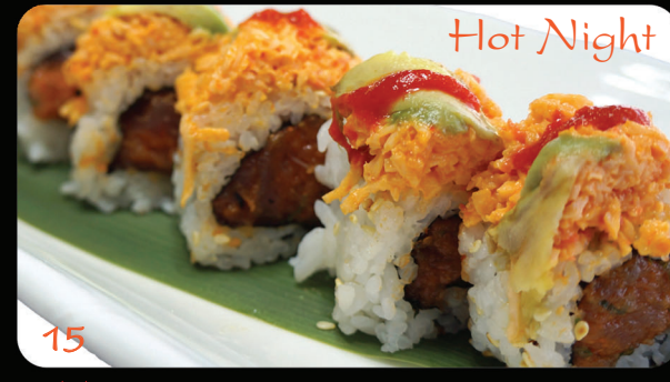
Spicy tuna, spicy crab & avocado on top