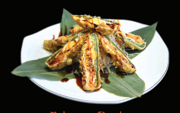
Jalapeño Bomb 16 Spicy tuna & cream cheese stuffed inside deep fried jalapeño w/ Spicy mayo sauce