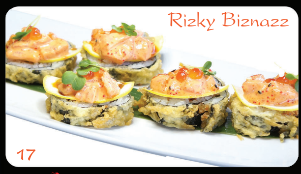
Spicy Tuna, cream cheese, jalapeño deep fried, spicy salmon on top