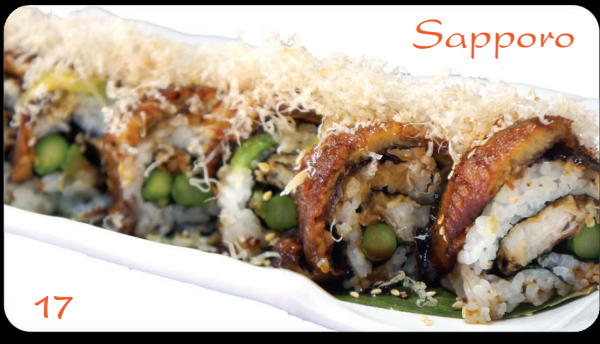
Soft shell crab, asparagus inside, unagi, bonito on top