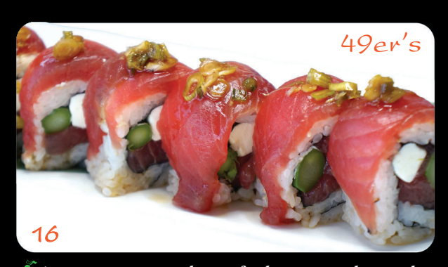
(Asparagus, cream cheese, fresh tuna on the inside and topped with fresh tuna and sweet jalapeño dressing