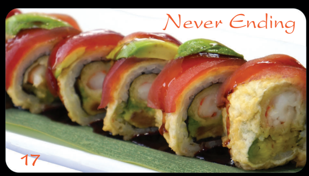
Deep fried tempura shrimp & avocado w/ tuna on top. served w/ eel sauce