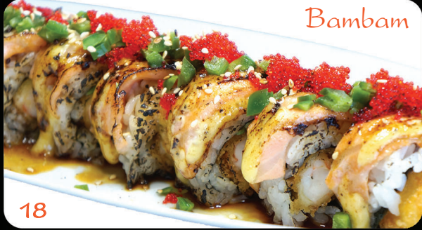
Spicy yellowtail, green unions, and shrimp tempura topped seared salmon, diced jalapeños, and tobiko with aburi sauce