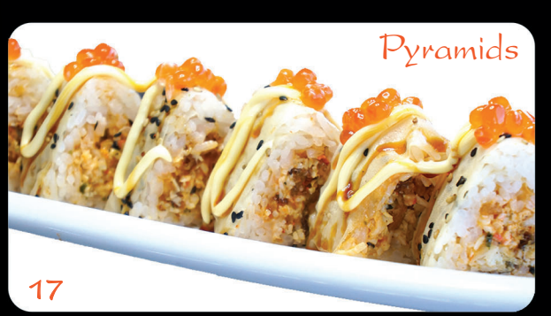
Spicy soft shell crab, avocado, spicy crab, wrapped with soy paper topped with tobiko