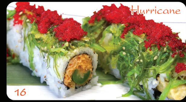
Deep fried jalapeño w/ spicy crab, seaweed salad and tobiko on top