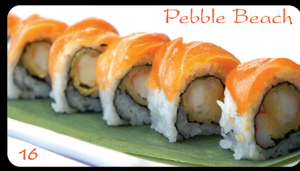
Tempura shrimp, kani topped w/ salmon and jalapeño dressing