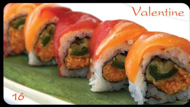
Deep fried jalapeño w/ spicy crab inside, tuna & salmon on top w/ soy vinegar