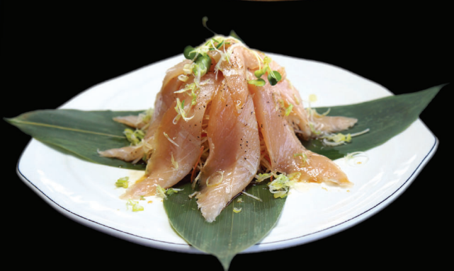
White Tuna Tataki 16 Albacore tataki sashimi w/ garlic ponzu sauce