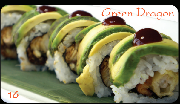
Tempura shrimp & eel, avocado on top w/ soy bbq sauce