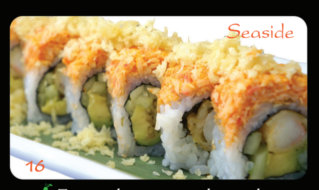
Tempura shrimp, spicy crab, avocado & cucumber, topped w/ Tempura flakes