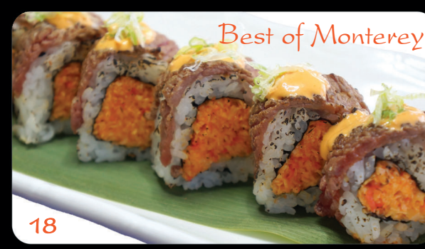
Spicy crab and seared fillet mignon topped with spicy mayo