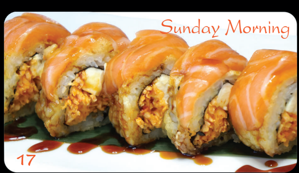
Deep fried cream cheese & spicy crab, salmon on top w/ sweet sauce