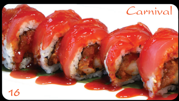
(( Spicy tuna, tempura shrimp, fresh tuna w/ house made Asian hot sauce