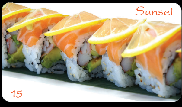
California roll with fresh salmon and thin lemon slices on top (Gluten-Free)