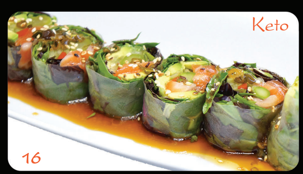
Spring mix, cucumber, avocado, gobo, asparagus, salmon with jalapeño sauce wrapped with rice paper. Aka (No rice roll)