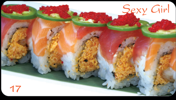
((Spicy crab & fried shrimp inside, tuna & salmon on top. jalapeño & fish egg w/ ponzu sauce