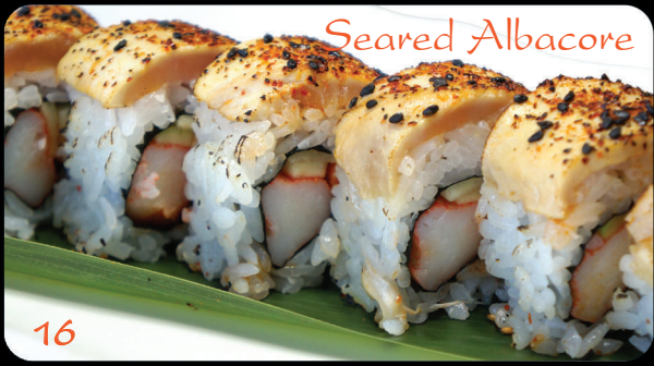
Kani, cucumber, avocado and gobo w/ seared Albacore seasoned w/ Japanese chili powder