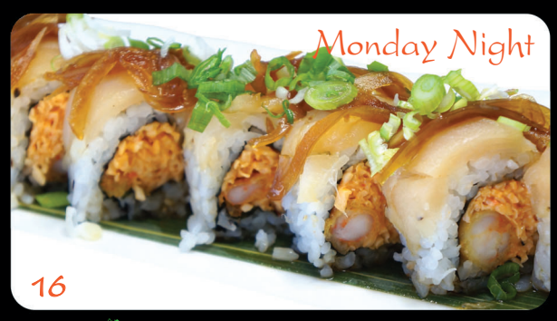
(Inside spicy crab & fried shrimp albacore on top w/ garlic sauce