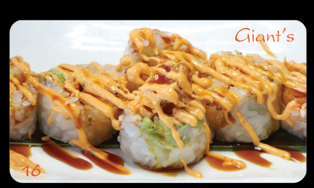
Rice pepper with spicy crab, avo, fried shrimp inside crunch on top. sweet sauce & spicy mayo