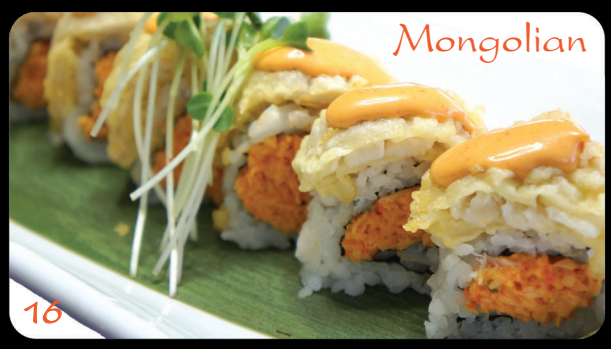
Spicy crab, deep fried snapper on top w/ creamy sauce