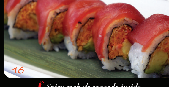
Spicy crab & avocado inside, fresh tuna on top w/ spicy mayo sauce