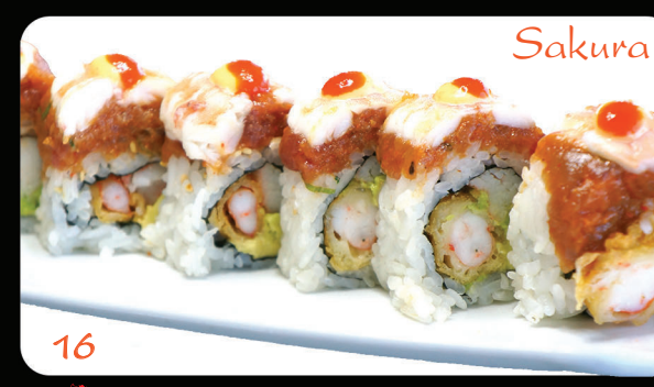
Tempura shrimp, kani, avocado, spicy tuna and boiled shrimp with spicy mayo, siracha and eel sauce