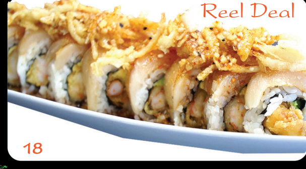
Shrimp tempura with avocado, Cajun albacore on top with fried crispy onions and spicy garlic ponzu sauce