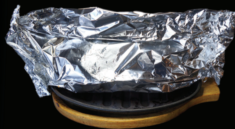
Best of Best Best of the Best presentation on a hot plate