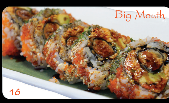
Spicy tuna, spicy crab, avocado, deep fried w/ eel sauce