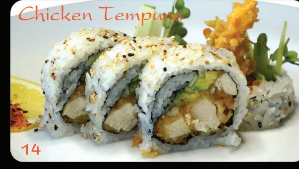
Chicken tempura, cucumber, gobo & kaiware