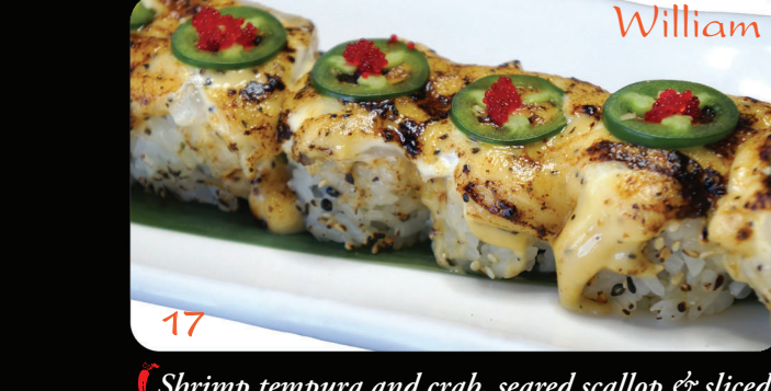
(Shrimp tempura and crab, seared scallop & sliced jalapeño on top