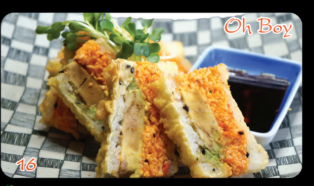
Spicy crab & avocado, wrapped in soybean paper, deep fried w/ eel sauce