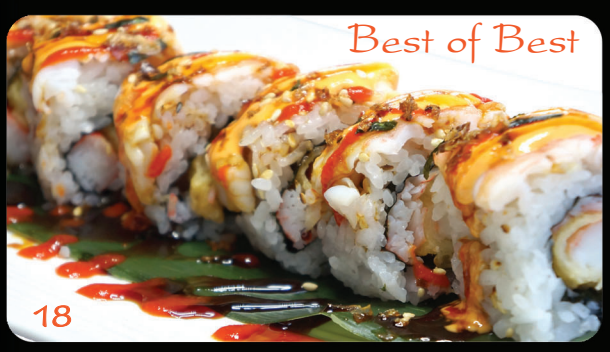
Tempura shrimp, crab & cooked shrimp on top w. spicy mayo eel sauce. Served on a hot fire plate