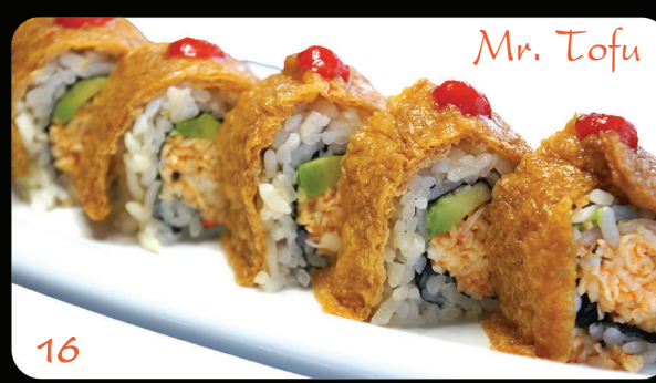
Spicy crab and avocado topped with inari (tofu skin)