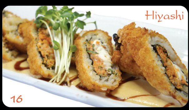
(Spicy tuna & cream cheese, creamy sauce & katsu sauce on top, deep fried w/ panko bread crumbs