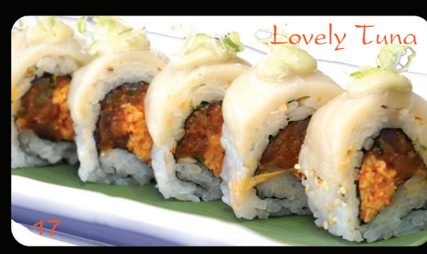
Spicy tuna and spicy crab w/ albacore tuna and wasabi mayo