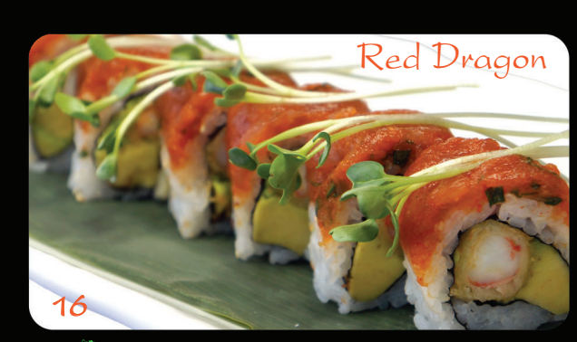
Tempura shrimp & avocado, spicy tuna on top w/ eel sauce